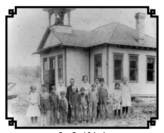
Frog Pond School

This arrangement lasted until 1920. It was at that point that the Frog Pond School and the Old Yellow School House both closed and high school classes ceased. The Millville school retained two teachers and served the lower four grades in the west room, currently the kitchen area of the Community Center, and served grades five through eight in the east room. Foothills students who wished to continue past the eighth grade had to be transported to Pleasant Prairie School and later to West Valley High School.