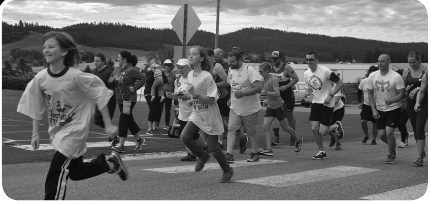
From a great start to beautiful scenery, the Foothills Fun Run is always a hit!