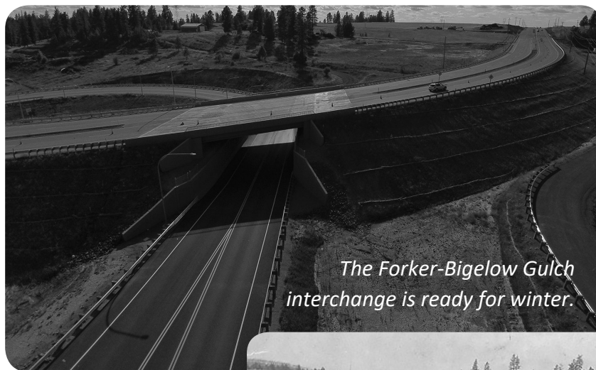
The Forker-Bigelow Gulch interchange is ready for winter.

We are now a few years into the significant road improvement projects underway to provide better access to our growing area. We all remember the crumbling pavement last year under the new Forker-Bigelow Gulch interchange, but this summer new permanent pavement has been put in place, and the interchange is expected to perform great no matter how much ice and snow we receive. Crews will continue working on completing the Bigelow Gulch expansion, and other portions of the project to improve access to/from Spokane Valley will continue in the years to come. Road construction has become a necessary evil for the Foothills residents.