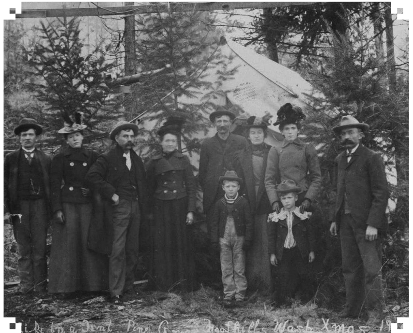
Christmas 1900 when there was a sawmill near what is now the Community Center.

Kids will love the annual Christmas Party at the Community Center taking place the afternoon of Saturday, December 7th. We always provide a Christmas craft project great for all ages and plenty of snacks and fun. And of course Santa Claus himself will make a visit to get a chance to talk to the kids and take some great pictures. Be sure to mark your calendars for this fun annual event to kick-off your family's holiday season.